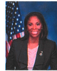
STACEY E. PLASKETT VIRGIN ISLANDS

2059 RAYBURN BUILDING WASHINGTON, DC 20515